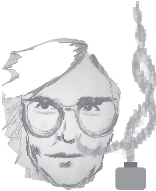
Figure 3. Caro Verbeek, illustration for Andy Warhol's Permanent Smell Collection , which can be seen as a scentscape or even an olfactory portrait of his life, 2021.