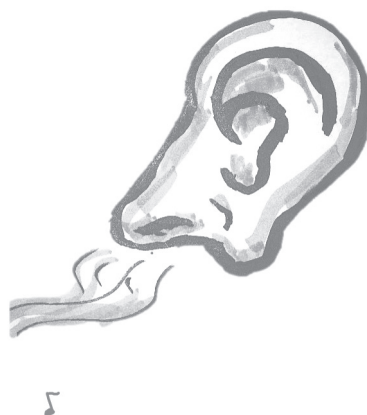
Figure 2. Caro Verbeek, illustration for Septimus Piesse's concept of “smound”, 2021.

A contraction of sound and smell. Septimus Piesse believed that sounds triggered the olfactory nerve and vice versa. According to more recent scientific insights, he was right. Piesse (1857), The Art of Perfumery . See Figure 2.