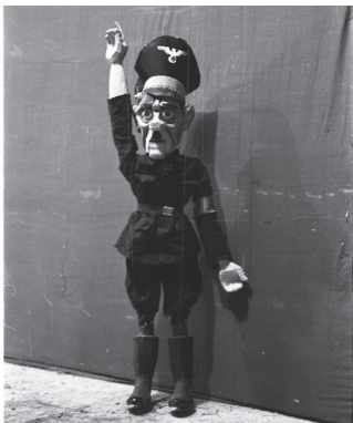
Lutke lutkovne predstave Jurček in razbojniki . Črnomelj, 12. februar 1945.