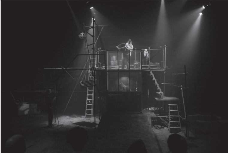
Conrad (The Heart of Darkness, Teatro de los sentidos, 2012)