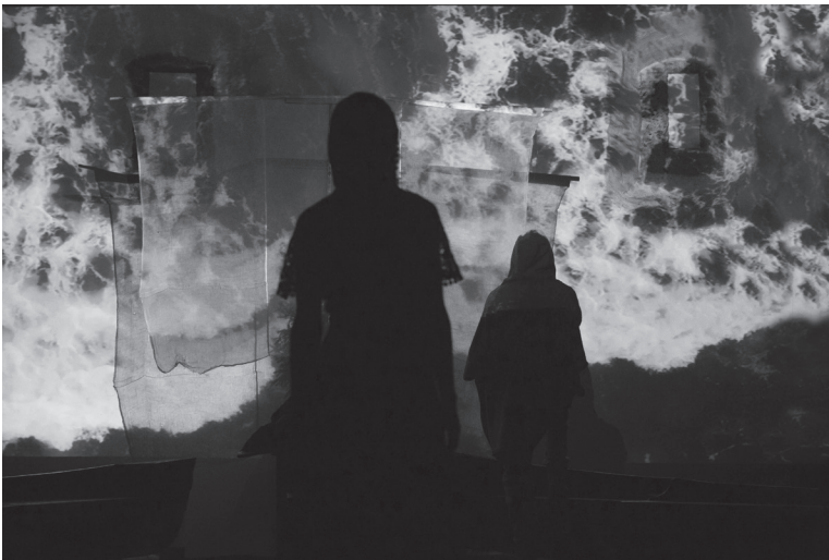
Prerok (Zavod Sensorium v koprodukciji s Prešernovim gledališčem Kranj, SMG in SSG Trst, 2018), foto: Nada Žgank.