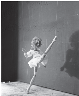
Lutke lutkovne predstave Jurček in razbojniki . Črnomelj, 12. februar 1945.