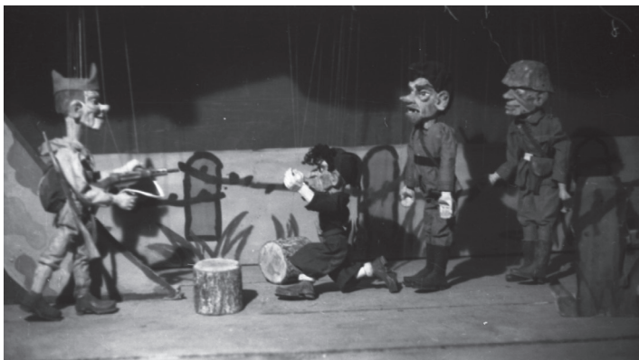
Predstava Jurček in razbojniki v lutkovnem gledališču v frančiškanski cerkvi v Ljubljani. Ljubljana, 28.6.1945.