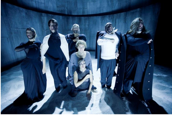
Peer Gynt